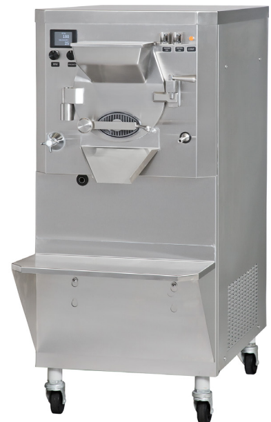
Shown With Optional Controls

*Excludes normal wear parts, see warranty card for details.